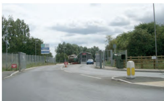
Entrance to Chichester Waste Transfer Station.

Heavy plant and large throughput mean sufficient space and height is necessary within enclosed waste transfer stations.