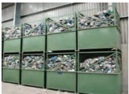
Sorted material awaiting recycling.