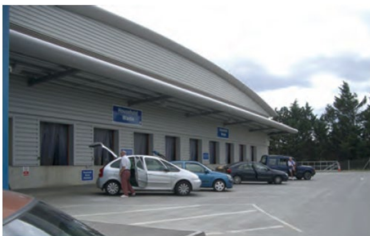
The design of the Chichester HWRS helps minimise problems with litter, odour, and vermin.