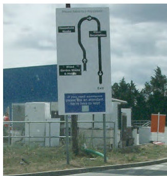
Clear, helpful signage at the Chichester HWRS.