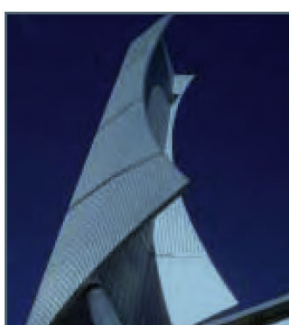
The design of the chimney on the Isle of Man, derived from a Viking sail reinforces the local identity and historic associations of an area.