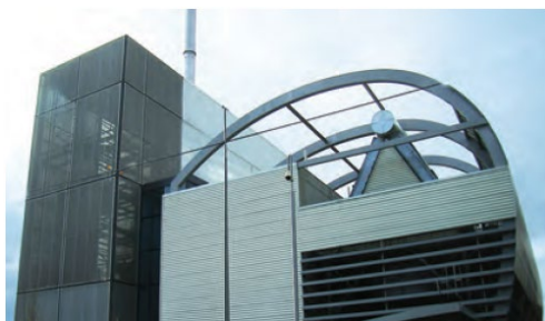
An innovative design to an Energy from Waste facility in an urban setting (Chineham, Hampshire).

residue), metals that can be recycled and Air Pollution Control (APC) residues.