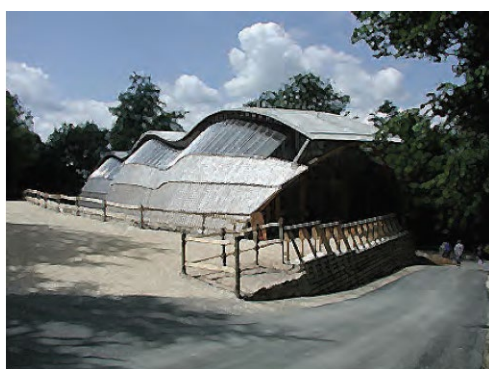
The Downland Gridshell highlights how the use of innovative designs can accommodate buildings which require a large roof form within a rural setting.

5.76 Large buildings in rural settings can draw upon landscape influences such as in the case of the Downland Gridshell. In many cases a timber framed building would be incompatible with a built waste facility, but it is an example of how form and structure can blend and complement the surrounding landscape with the roof form echoing the rolling hills.