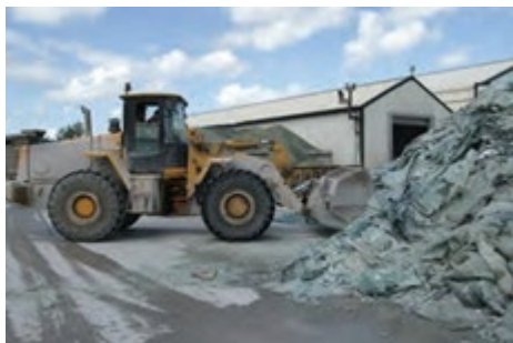
Used building materials being mechanically sorted.