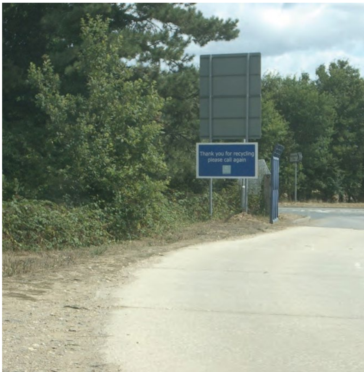
Chichester Household Waste Recycling Site.