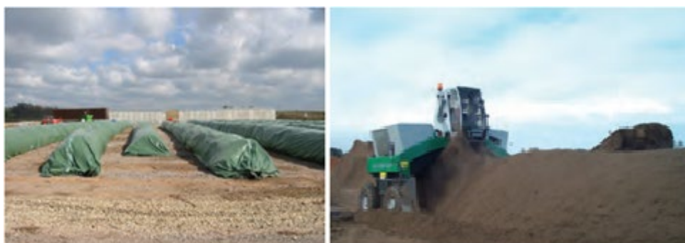
Left: Covered composting pods. Right: Compost being turned