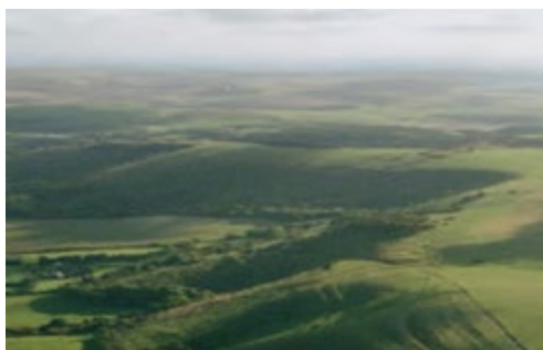
The rolling downland character of West Sussex.