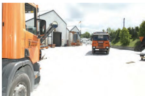
Delivery of inert material.