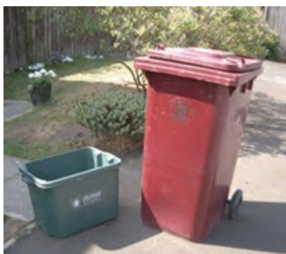
Recycling bins provided in Chichester District.