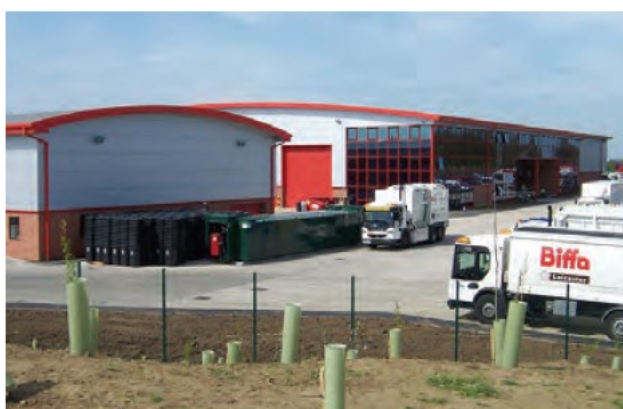
Leicester MBT 'Ball Mill' Site, an example of how a site can be kept clean and litter free through appropriate storage and fencing.