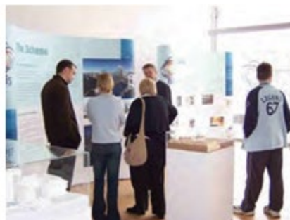
Public consultation events.