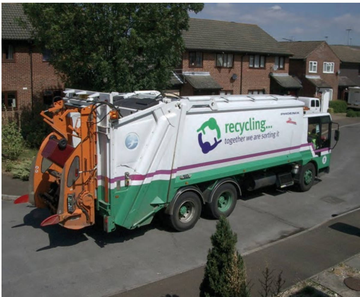
A refuse vehicle in West Sussex with a clear message encouraging recycling.