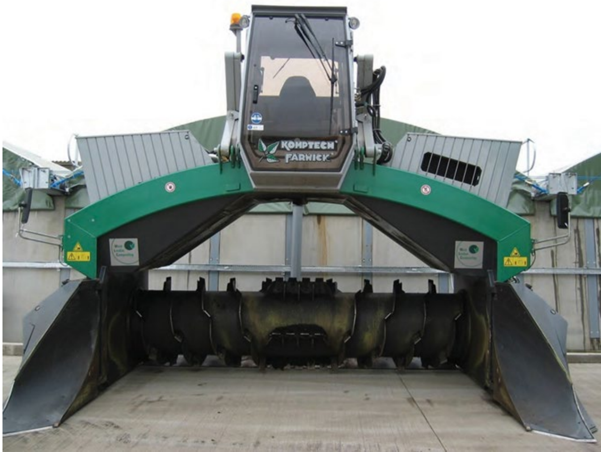
Open Windrow Compost Turner.