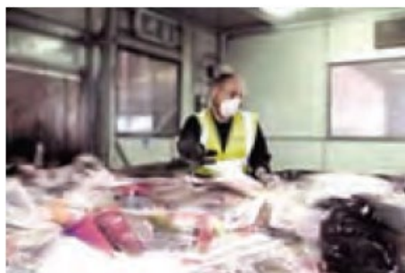
The use of enclosed, controlled environments to prevent odour emissions.