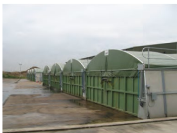
In-vessel composting, West London.