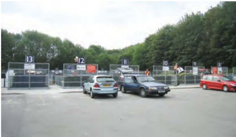
A household waste recycling site with open but clearly marked bins.