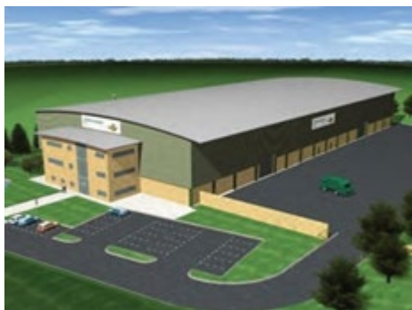
Illustrative 3D model of an Autoclave Plant.