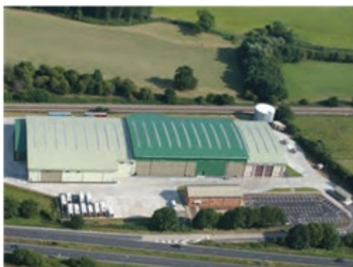
Alton Materials Recovery Facility, which is situated adjacent to the major road network.